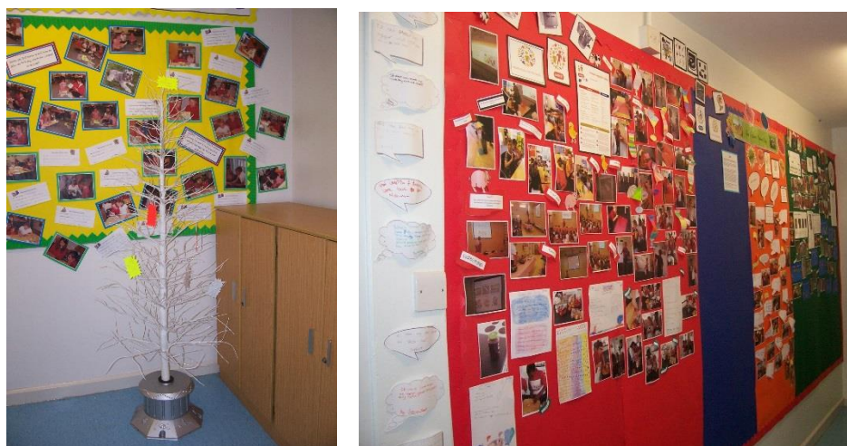
Figure 4: The 'wonder tree' for sharing questions (left) and other Open Futures display

This suggests change within practices and understanding at Southside ( staff culture and student milieu ), but it is evident that these more intangible developments are bolstered by embedded changes to curriculum, staff training and the school environment ( organisation and ecology ). For example, training of Southside staff in askit ensures that this strand is an integral part of learning from Foundation Stage through to Year 6. The physical environment is also important to the school's development of askit, since, in addition to developing skills and exploring topics in lessons, pupils are encouraged to use the 'wonder tree' (see Figure 4) as a means through which they can ask their own questions and offer answers across the school. This has proved to be a popular resource, facilitating reflections and conversations across year groups.