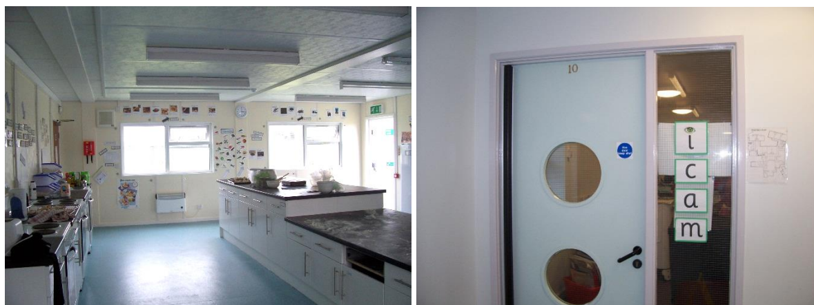
Figure 3: Mobile classroom converted for cooking (left) and space allocated to filimit (right)

space and ensure high visibility (see figure 2). Southside developed an existing mobile classroom into a cooking space with adjoining classroom, and space was found for filimit, in a classroom now devoted to filimit and music, allowing easy access to resources and additional space for activities (see figure 3).