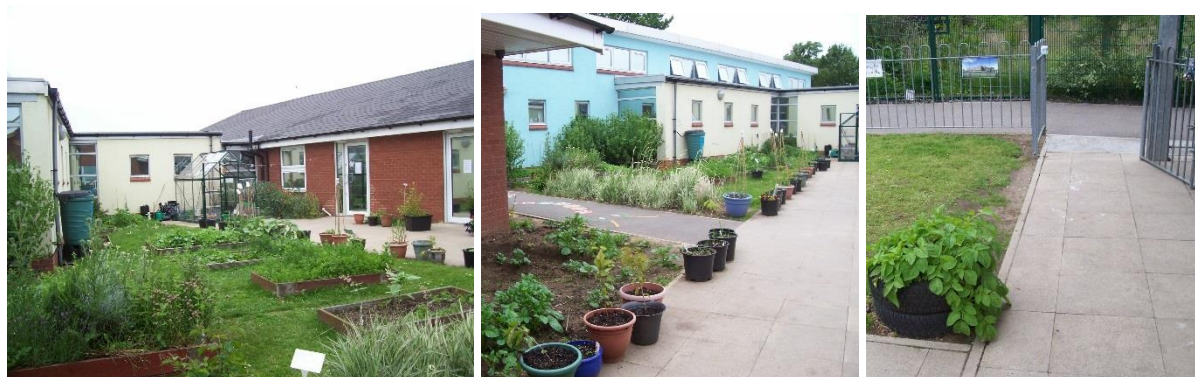
Figure 2: Visible growing space developed

In common with the other schools involved in our evaluation, Open Futures at Southside acted as a catalyst for immediate tangible changes that the school was intending or aspiring to make in curriculum content ( organisation ), development of physical space ( ecology ), enterprise and community links ( staff culture and student milieu ). This was seen in the finding and organising of physical space for the programme, new topics added to the curriculum to build links between strands and with existing content, and open days to showcase gardening and involve parents. Strand leads were appointed for each strand. The head teacher also ensured that Open Futures was on the agenda for school and governors meetings, and adapted budgets and staff deployment to accommodate and resource the programme.